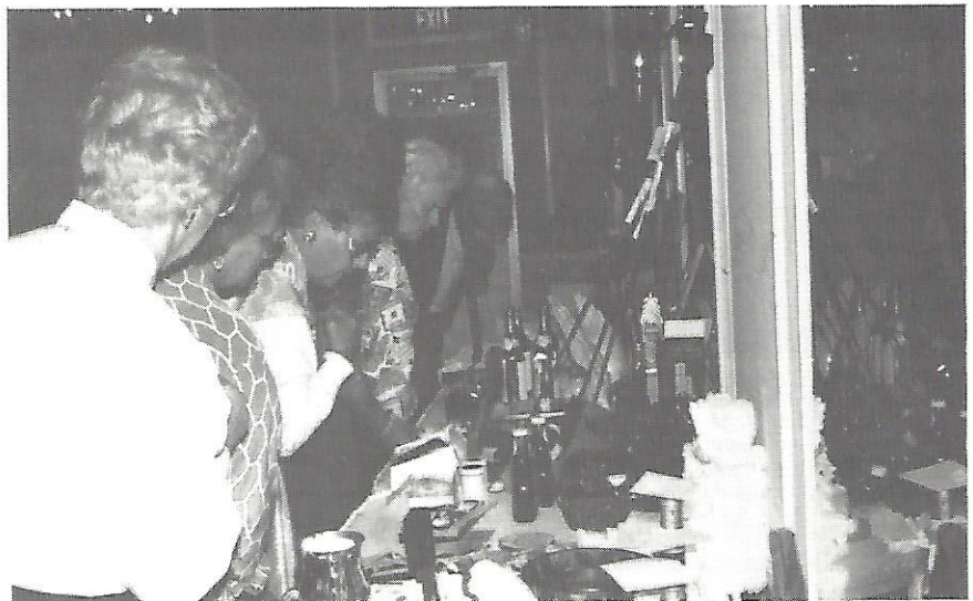
Looking at the "goodies" donated for the auction