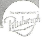
Pittsburgh's compact downtown area is surrounded by three sparkling rivers.