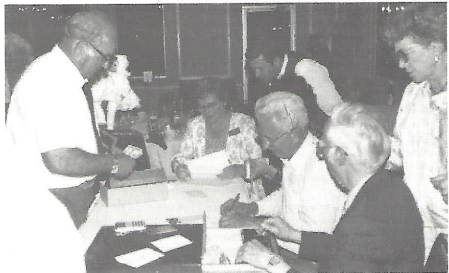
When you bid and buy at the auction, you gotta' pay