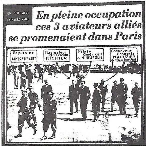
AT THE HEIGHT OF THE OCCUPATION THESE 3 ALLIED AIRMEN TAKE A STROLL IN PARIS

presse 2 Francs 6 e édition MERCREDI 27 MARS 1946