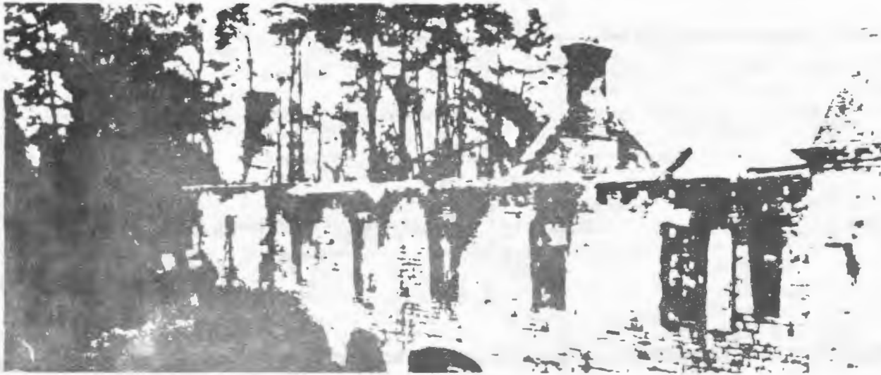
CHATEAU DE BOURG-BLANC DESTROYED BY FIRE

The Chateau du Bourg-Blanc, home for many allied airmen during World War II, was destroyed by a fire of mysterious origin earlier this year.